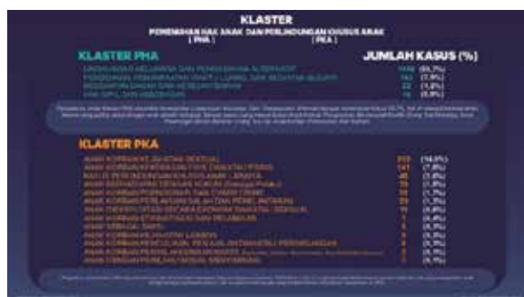
Diagram 2. Cases of Child Victims of Violence

Law Number 12 of 2022 concerning Criminal Acts of Sexual Violence (Law on Sexual Offences) introduced in May 2022 has refined the definition of criminal acts of sexual offences and criminalized its forms and types, one of which is electronic-based sexual violence. Facility of communication and information access through internet has resulted in cases occurring in the cyberspace, including electronic-based sexual violence, which is technological harassment of the victim's gender or sexual identity. 4 Most frequently reported of electronic-based sexual violence involves the dissemination of sexual explicit photos or videos of the victim. One of the most sexual offences cases of electronic-based sexual violence in Indonesia is sextortion.